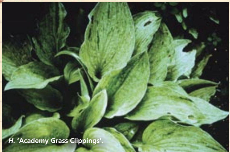
H. 'Academy Grass Clippings'.