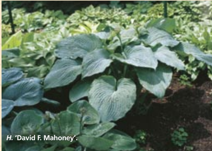
H. 'David F. Mahoney'.