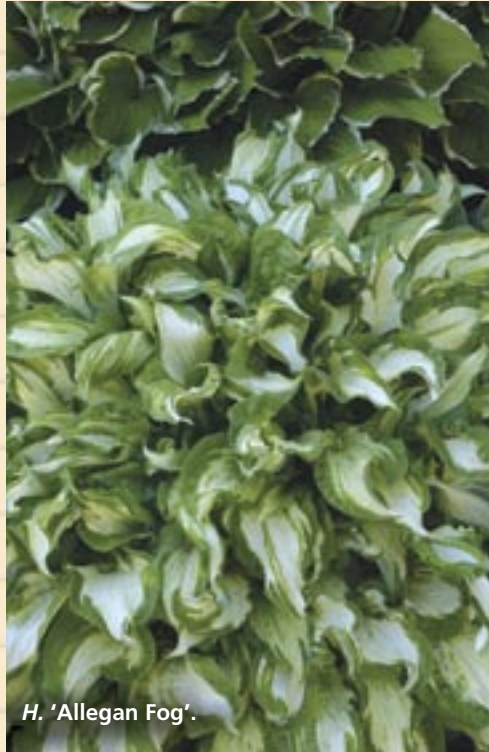
H. 'Allegan Fog'.

An example of success from the third approach, picking pods from a rarely fertile pod parent, is shown in the accompanying photographs. When my division of 'Allegan Fog', which rarely sets seed, showed three seed pods the first season, I harvested them. I got only three seedlings, but each of them had a new kind of variegation. The entire leaf on each is stippled with grass-clippings streaking, just like the white center of 'Allegan Fog'. This result runs counter to the conventional wisdom that stable variegated parents produce solid-colored seedlings. The largest of these I have registered as 'Academy Grass Clippings'. Best of all, it is fully fertile and its seedlings are wildly streaked. I have no clue what's going on here, but I discovered this stuff in the rarely plowed 'Fortune' field.