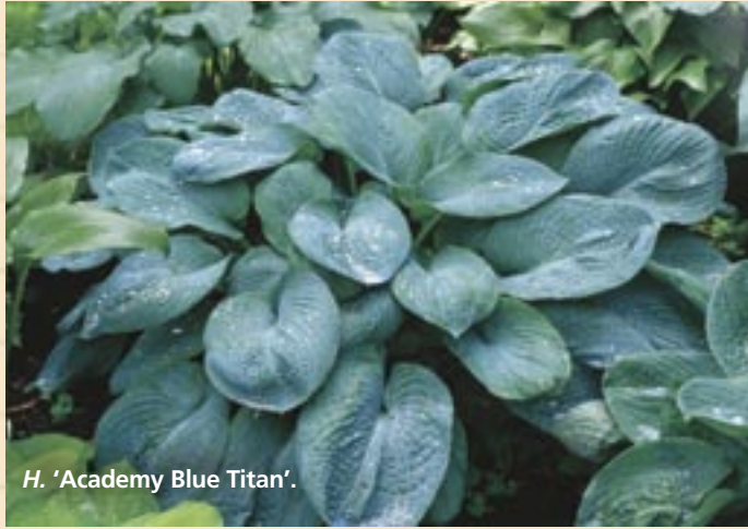
H. 'Academy Blue Titan'.