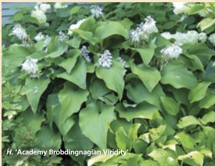
H. 'Academy Brobdingnagian Viridity'.