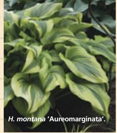
H. montana 'Aureomarginata'.